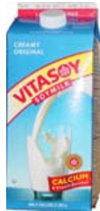
Vitasoy® Creamy Original Soy Milk