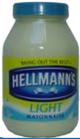
Hellmann's® Light Mayonnaise