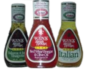
Ken's® Dressings: - Lite Italian - Red Wine Vinegar & Olive Oil - Balsamic Vinaigrette