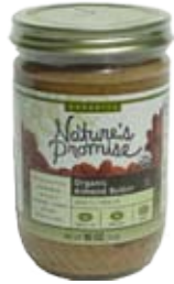
NaturesPromise® Almond Butter