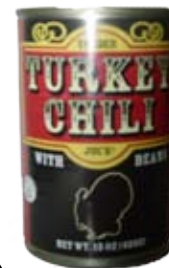
Trader Joes® Turkey Chili