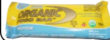
OrganicFood Bar™ "Protein" flavor