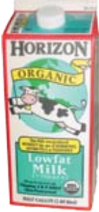
Horizon® Organic 1% Lowfat Milk