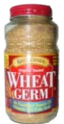
Kretschmer® Original Wheat Germ