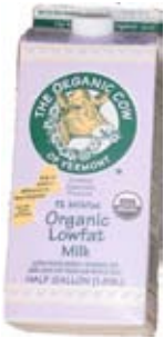
The Organic Cow® Creamy Organic 1% Milk