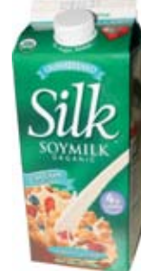
Silk® Unsweetened Soy Milk