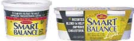
Smart Balance® Buttery Spread