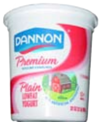
Dannon® Plain Lowfat Yogurt