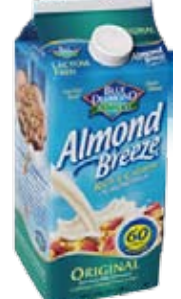
Blue Diamond® sweetened almond milk (original)