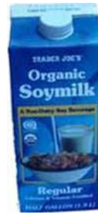
Trader Joes® Regular Soy Milk