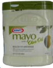
Kraft® Mayonnaise made with olive oil.